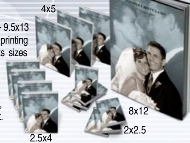
4x5 2.5x4 8x12 2x2.5

The primary books sizes 8x12 - 9.5x13 - 12x16 are available in all printing technologies, the primary books sizes 13x13 - 16x16 - 16x20 only in photographic paper. The small book copies 2x2.5 - 2.5x4 - 4x4 - 4x5 - 8x8 - 8x12, are available only in digital offset.