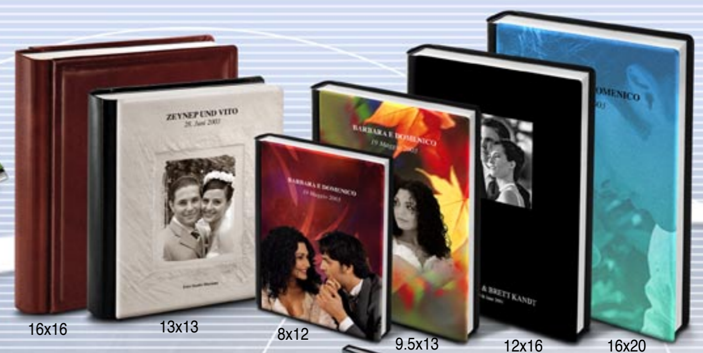
16x16 13x13 8x12 9.5x13 12x16 16x20